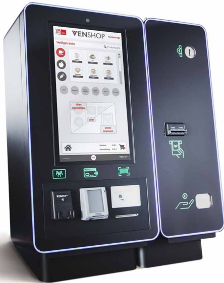
Cashless-Modul + Add-on module (cash)

As the central payment system for the entire shop, including all vending machines, it enables cashless payments of all kinds as well as cash payments on request.